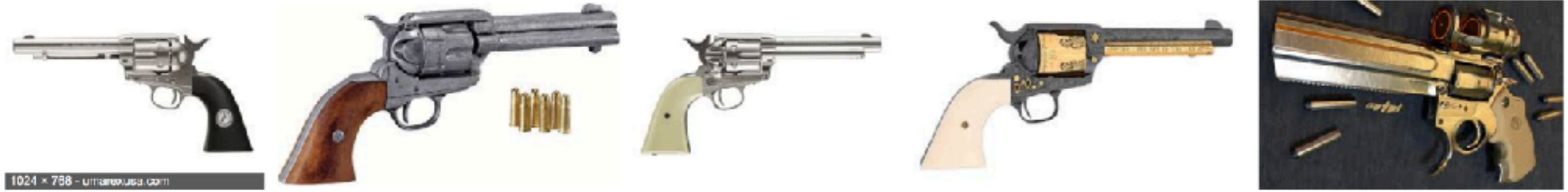
1024 x 788